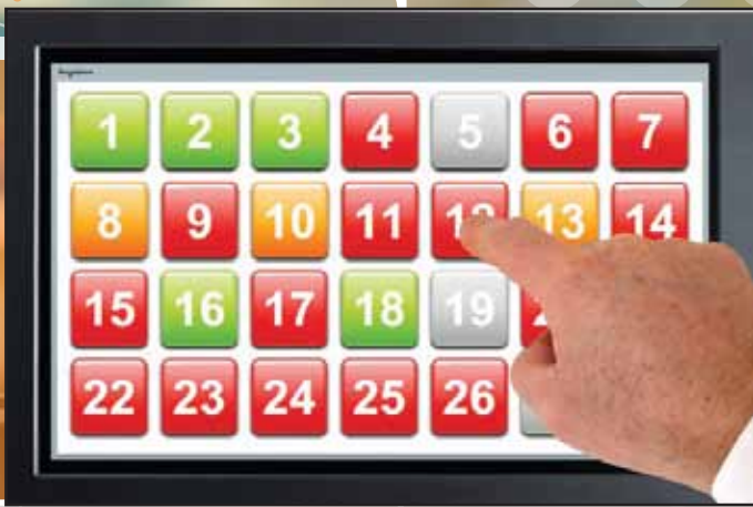
effectively control the front end