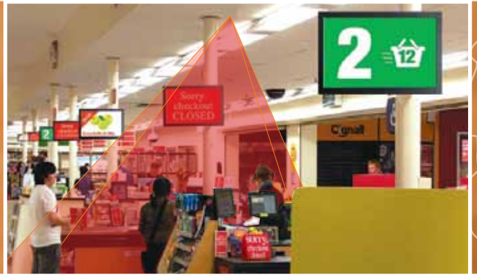
monitors transactional throughput and queues