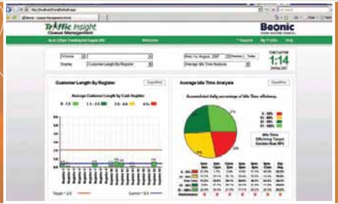
advanced end-of-day reporting